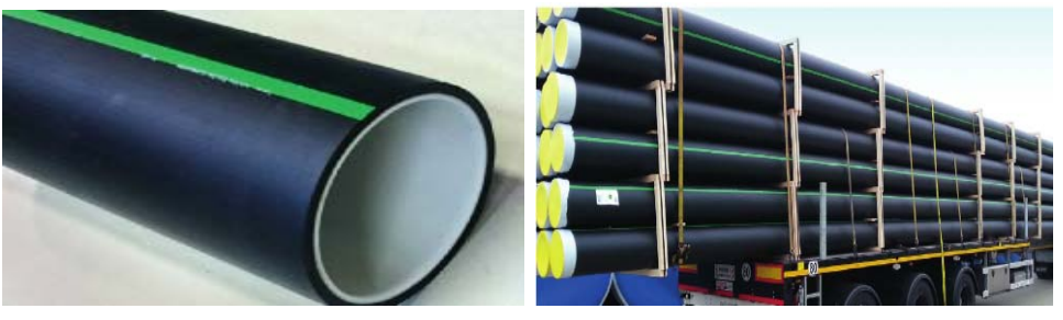
Figure 3: Composite piping used for the underground pipe network

The pipe network is commonly constructed of steel (carbon and aluminum stainless steel) with a pipe diameter generally between 200-500mm and buried 1-2m deep. The thickness and curve radius of the underground pipe system is directly dependent on the type and quantity of waste proposed.