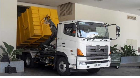
Figure 4: Collection stations located within buildings on ground floor