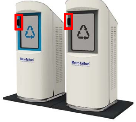
Figure 6: Waste inlet's with the RFID System