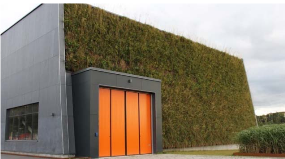
Figure 5: Stand-alone collection stations